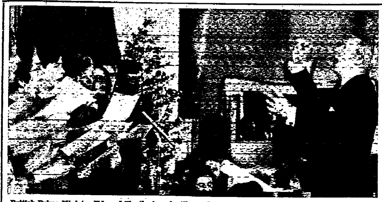
British Prime Minister Edward Heath sings lustily as he wields his baton while conducting a carol concert in Broadstairs, England, in aid of local charities.